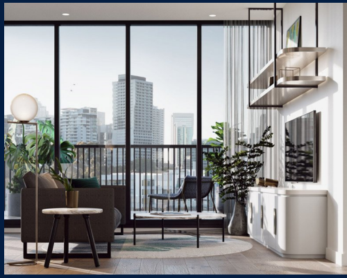
Roden : 3 - Bedrooom + Study