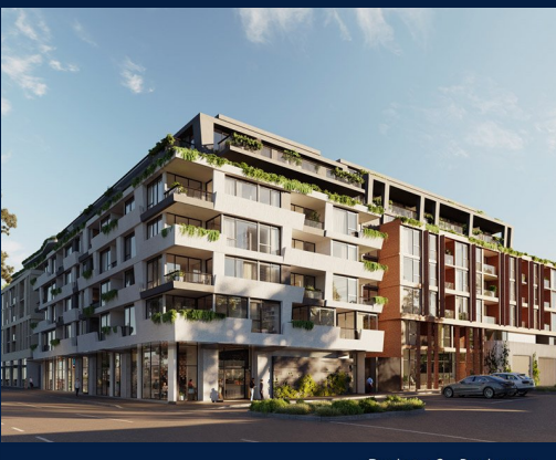
Roden: 2 - Bedroom